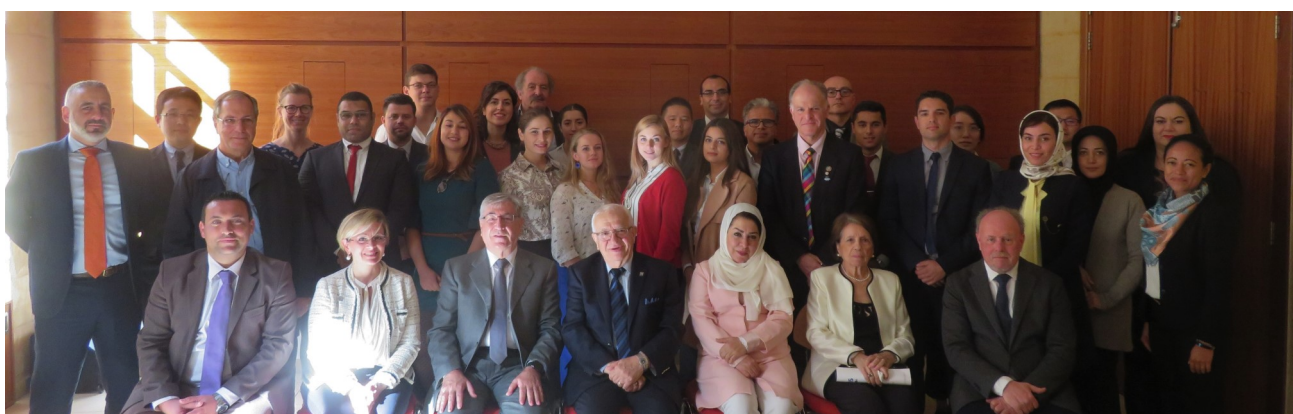
Above: The IOI Malta Training Programme Class of 2019, IOI Faculty, and Special Seminar Speakers.